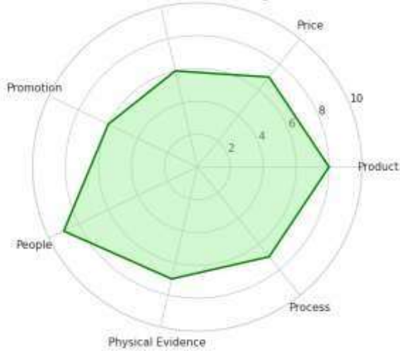
Fig 2: 7Ps of Healthcare Marketing Mix

followed closely by Branding and Content Marketing. Email Marketing, Health Camps, Referral Programs, and CME/CNE also show significant levels of importance, though comparatively lower than the top three.