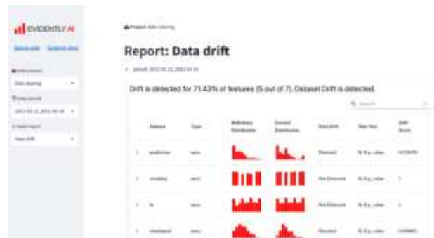
Fig 6.1: Dataset Evaluation