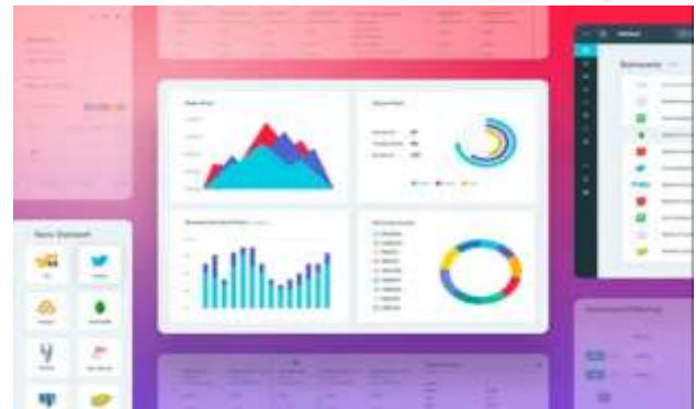
Fig 6.2: Analysis page