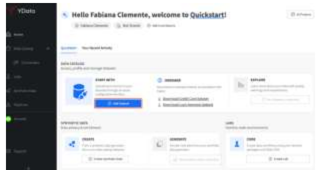
Fig 6.3: Report Page